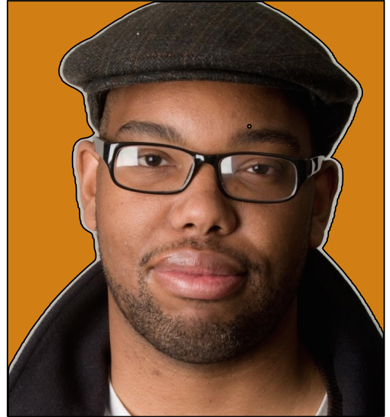
Ta-Nehisi Coates , author of The Beautiful Struggle .

I would trust citizen journalism as much as I would trust citizen surgery.