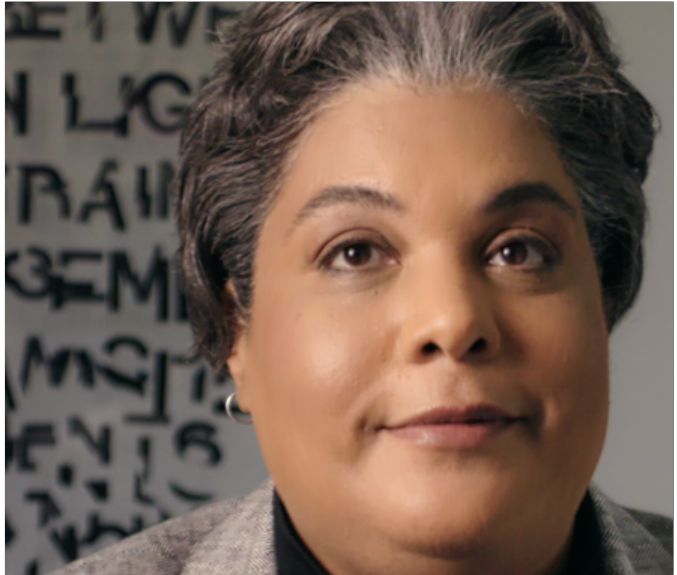
Roxane Gay , author of Hunger

BU has a student honor code. Know it. Take this pledge: "On my honor, I have neither given nor received unauthorized aid in doing the assignment." I will not tolerate cheating. If I discover that you have violated the honor code, I will do everything I can to boot you from the class and from the college. The Boston University academic conduct code is here: www.bu.edu/academics/resources/academic-conduct-code/