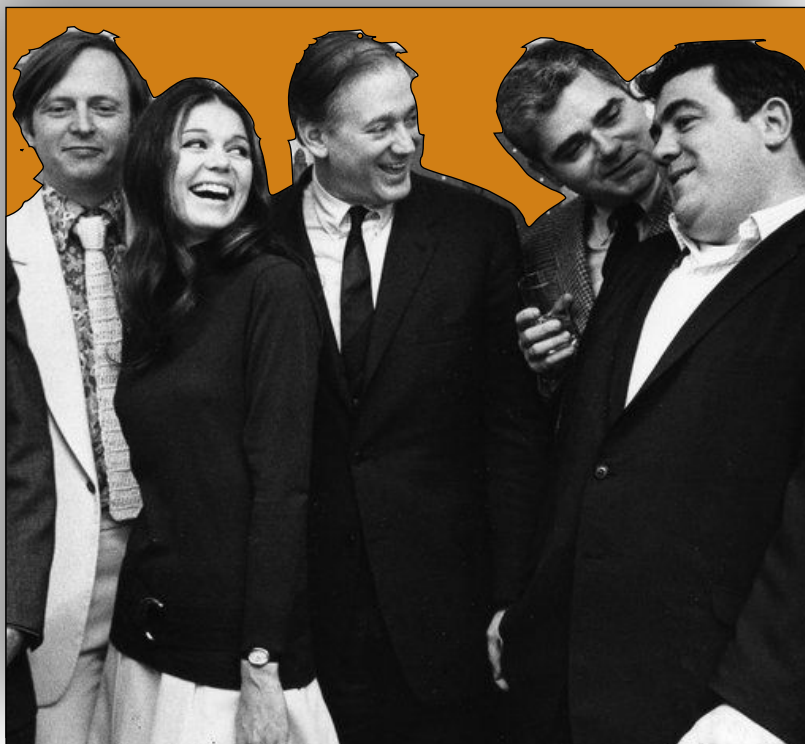
Giants of literary journalism. In the New York magazine newsroom in the later 1960s, left to right: Tom Wolfe, Gloria Steinem, Clay Felker, Peter Maas and Jimmy Breslin. Felker, William Shawn of The New Yorker and Harold Hayes of Esquire were the editors responsible for the flowering of literary journalism.