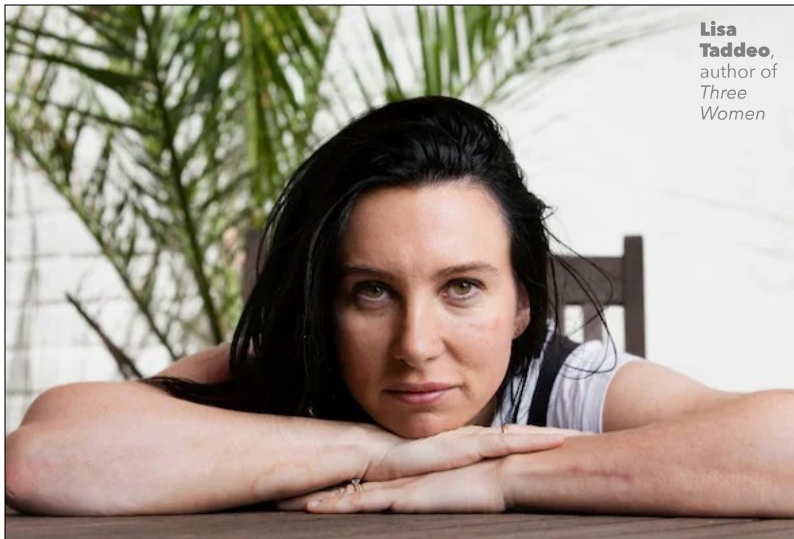
Lisa Taddeo , author of Three Women

In this course, we study literary journalism and experiment with writing beyond the norm of everyday journalism. We also study the lives and works of several great practitioners.