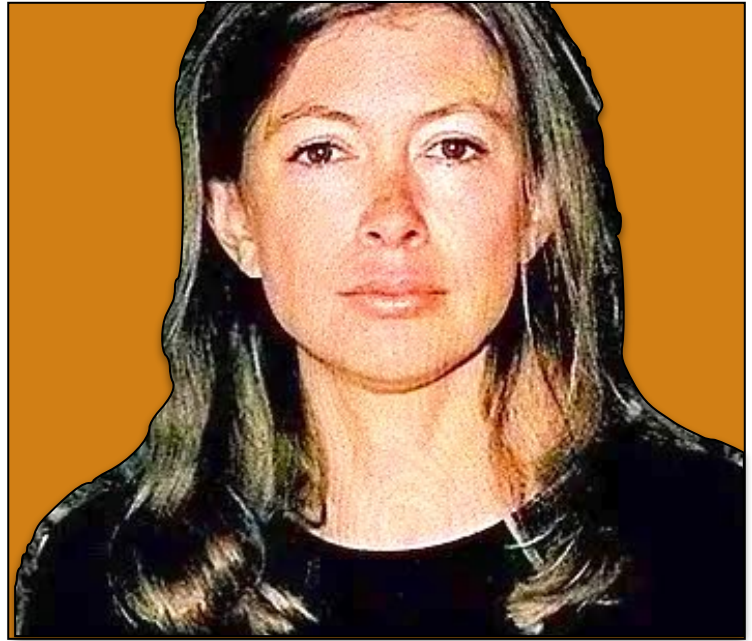
Joan Didion , author of The Year of Magical Thinking .

Here are some of the people we will study (or at least discuss) this semester. This is roughly the order in which we will consider them. Storytellers indicated with an asterisk are those whose work we are required to read. I encourage you to read the others on your own. (This is just a starter list.)