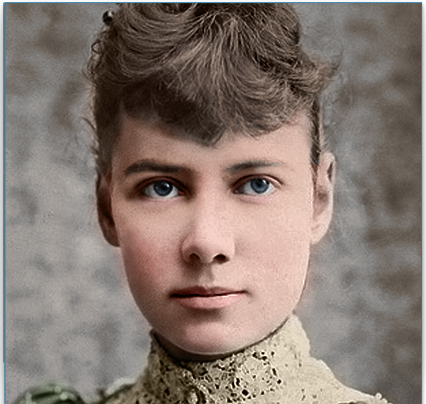
Nellie Bly was America's first celebrity reporter.

Also see bu.edu/policies to learn about reporting sexual harassment and sexual misconduct. More information follows.