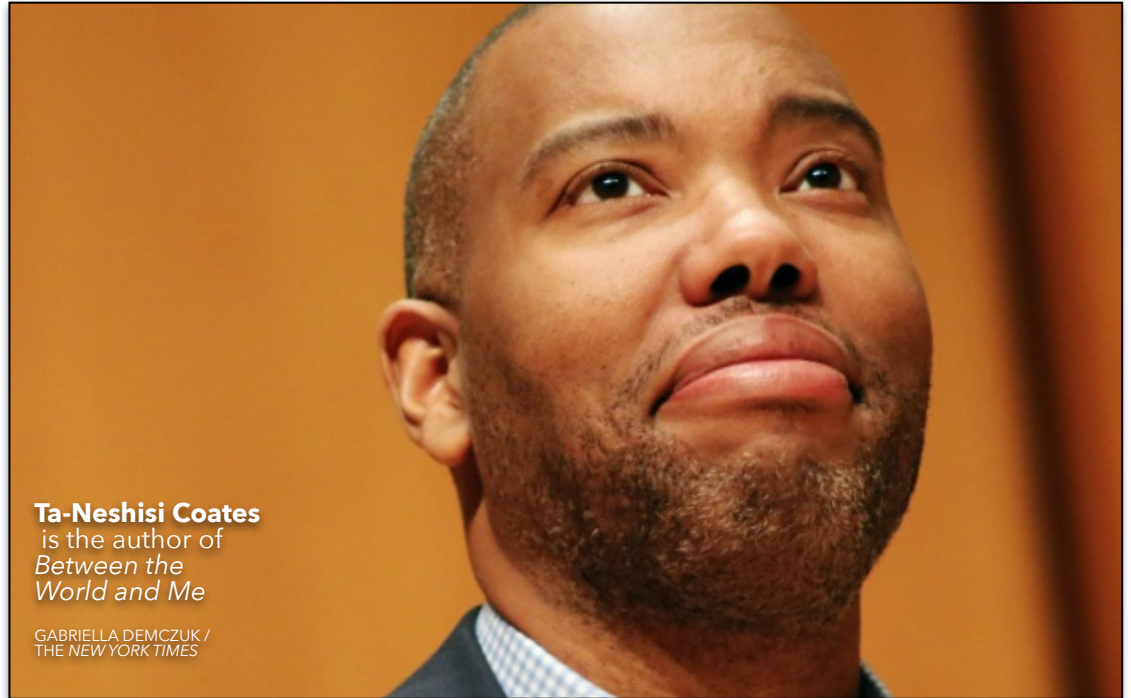
Ta-Nehisi Coates is the author of Between the World and Me