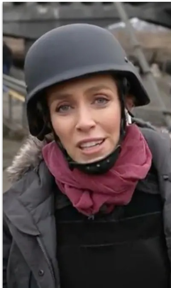
Clarissa Ward is the author of On All Fronts .

I would trust citizen journalism as much as I would trust citizen surgery.