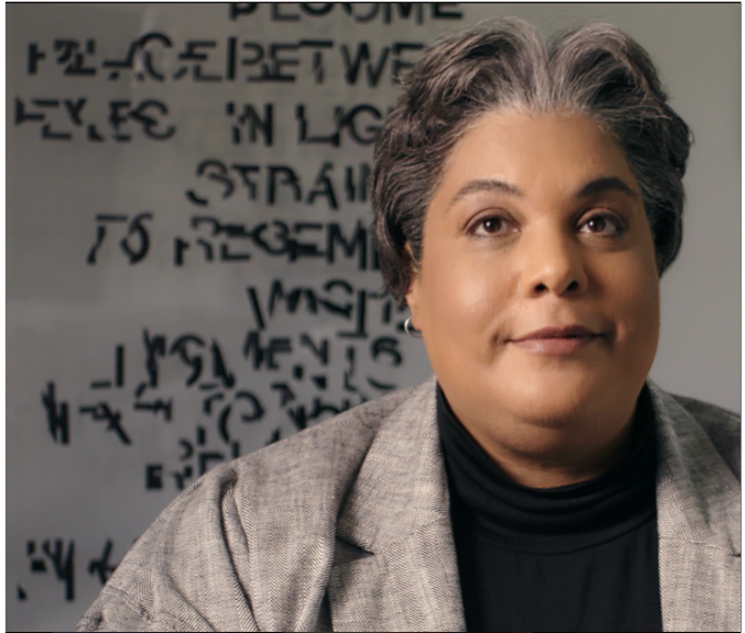
Roxane Gay , author of Hunger

BU has a student honor code. Know it. Take this pledge: "On my honor, I have neither given nor received unauthorized aid in doing the assignment." I will not tolerate cheating. If I discover that you have violated the honor code, I will do everything I can to boot you from the class and from the college. The Boston University academic conduct code is here: www.bu.edu/academics/resources/academic-conduct-code/