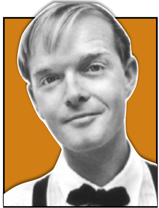
Truman Capote , author of In Cold Blood

Thus: 47. Edna Buchanan, telephone interview, March 28, 2025.