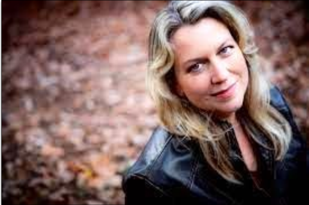
Cheryl Strayed , author of Wild