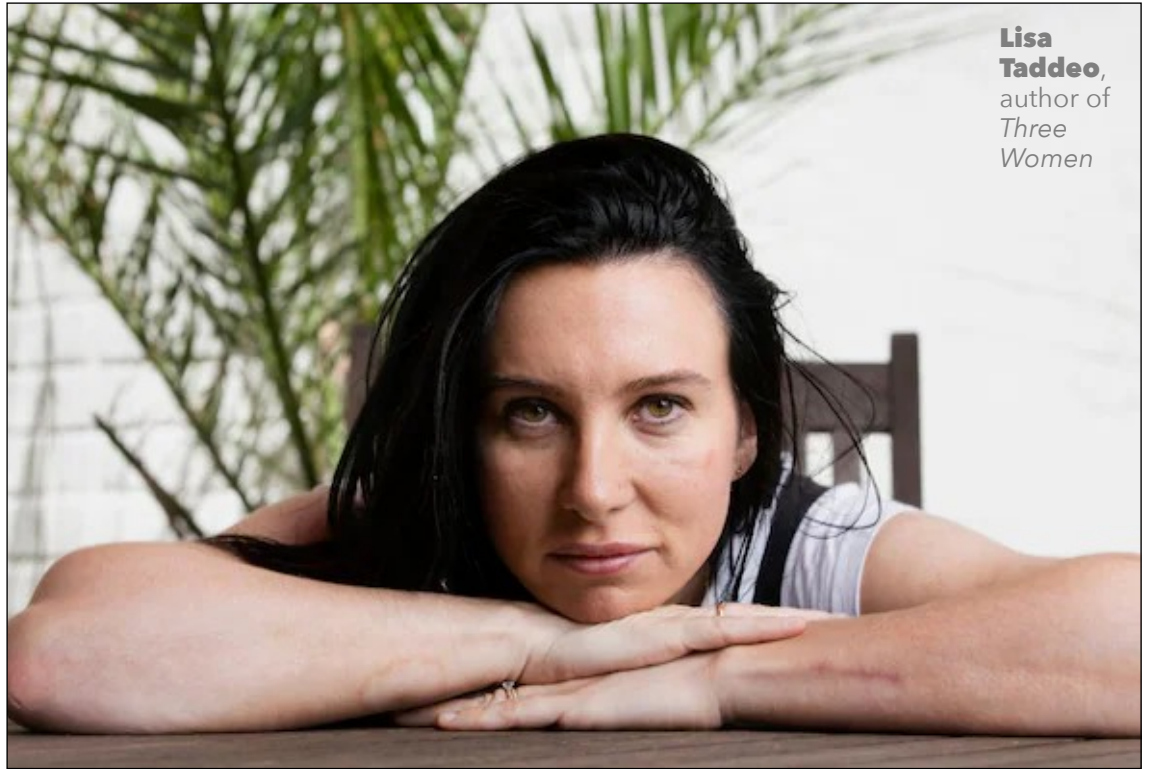
Lisa Taddeo , author of Three Women

In this course, we study literary journalism and experiment with writing beyond the norm of everyday journalism. We also study the lives and works of several great practitioners.