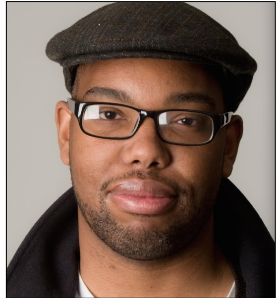
Ta-Nehisi Coates , author of The Beautiful Struggle .

I would trust citizen journalism as much as I would trust citizen surgery.