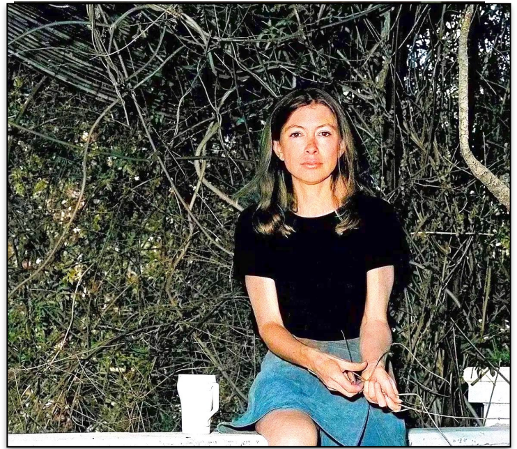
Joan Didion , author of The Year of Magical Thinking .

Here are some of the people we will study (or at least discuss) this semester. This is roughly the order in which we will consider them. Storytellers indicated with an asterisk are those whose work we are required to read. I encourage you to read the others on your own. (This is just a starter list.)