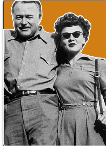
Lillian Ross (right), author of Reporting Always , with Ernest Hemingway, subject of one of her most celebrated and controversial works.

Note: Any student who is experiencing food or housing insecurity and believes this may affect their performance in the course is urged to contact the Dean of Students for