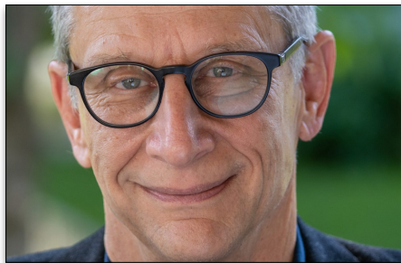
David Finkel , author of An American Dreamer .

3. A positive classroom. At your discretion, please alert me to anything related to preferred pronouns, preferred name or nickname, or any extenuating circumstances or trigger warnings (personal, medical, etc.) that might impact your classroom experience. I want to make sure you have the most positive experience in the classroom as possible. If work that gets shown in this class, professional or student-generated, offends you in anyway, please mention it in class or talk to us privately about it so that we can all learn from each other. This is not to say we will ever restrict freedom of speech or water down an aggressive or edgy idea, but we want to discuss anything that someone deems troublesome or offensive.