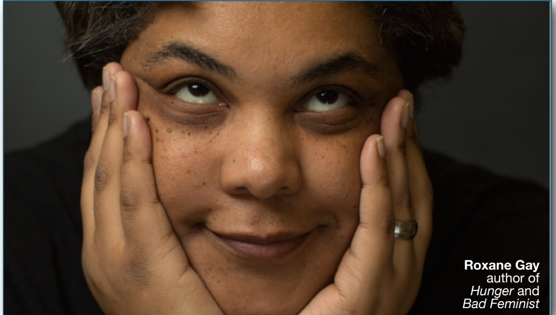
Roxane Gay author of Hunger and Bad Feminist