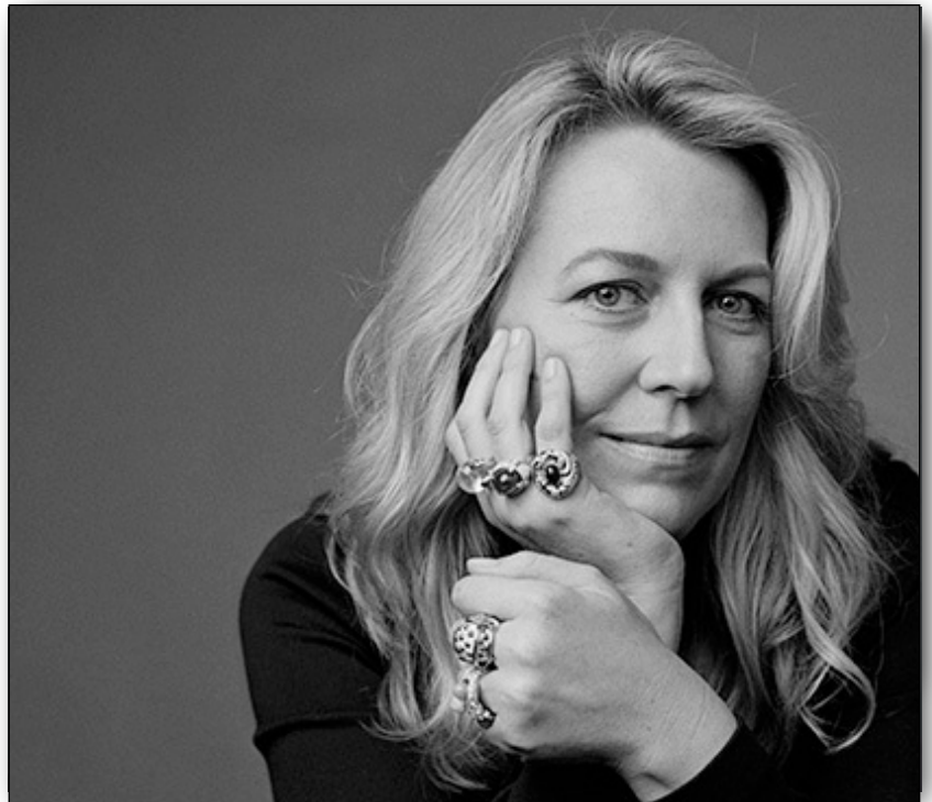
Cheryl Strayed , author of Wild .

BU has a student honor code. Know it. Take this pledge: "On my honor, I have neither given nor received unauthorized aid in doing the assignment." I will not tolerate cheating. If I discover that you have violated the honor code, I will do everything I can to boot you from the class and from the college. The Boston University academic conduct code is here: www.bu.edu/academics/resources/academic-conduct-code/