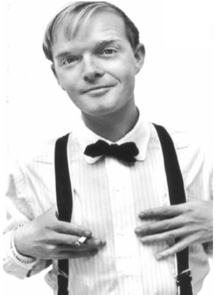
Young Truman Capote shows off his suspenders.

It can take the form of a paper, a website or a podcast.