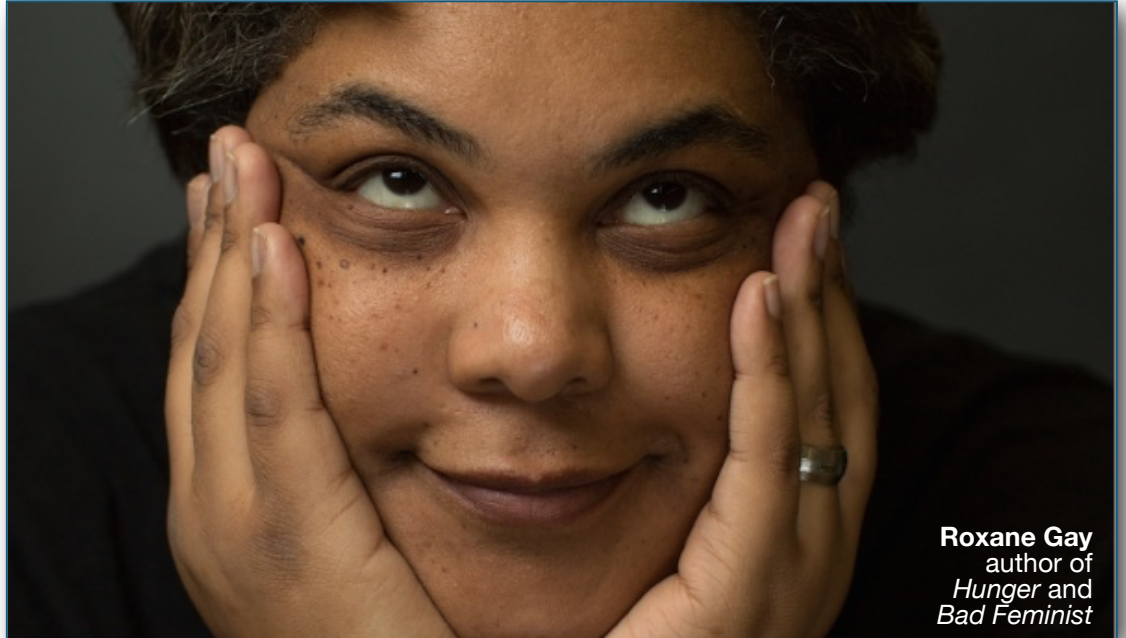
Roxane Gay author of Hunger and Bad Feminist