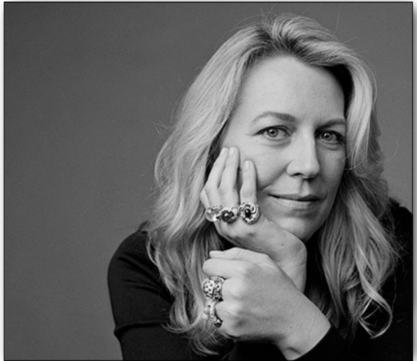
Cheryl Strayed , author of Wild .

BU has a student honor code. Know it. Take this pledge: "On my honor, I have neither given nor received unauthorized aid in doing the assignment." I will not tolerate cheating. If I discover that you have violated the honor code, I will do everything I can to boot you from the class and from the college. The Boston University academic conduct code is here: www.bu.edu/academics/resources/academic-conduct-code/