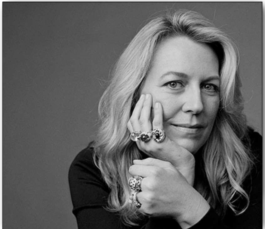
Cheryl Strayed , author of Wild .

BU has a student honor code. Know it. Take this pledge: "On my honor, I have neither given nor received unauthorized aid in doing the assignment." I will not tolerate cheating. If I discover that you have violated the honor code, I will do everything I can to boot you from the class and from the college. The Boston University academic conduct code is here: www.bu.edu/academics/resources/academic-conduct-code/