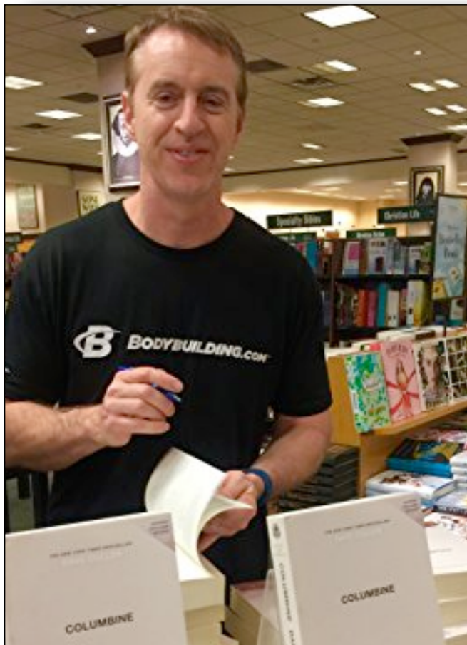
Dave Cullen , author of the intense nonfiction masterpiece Columbine .