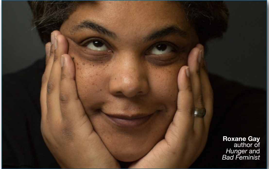
Roxane Gay author of Hunger and Bad Feminist