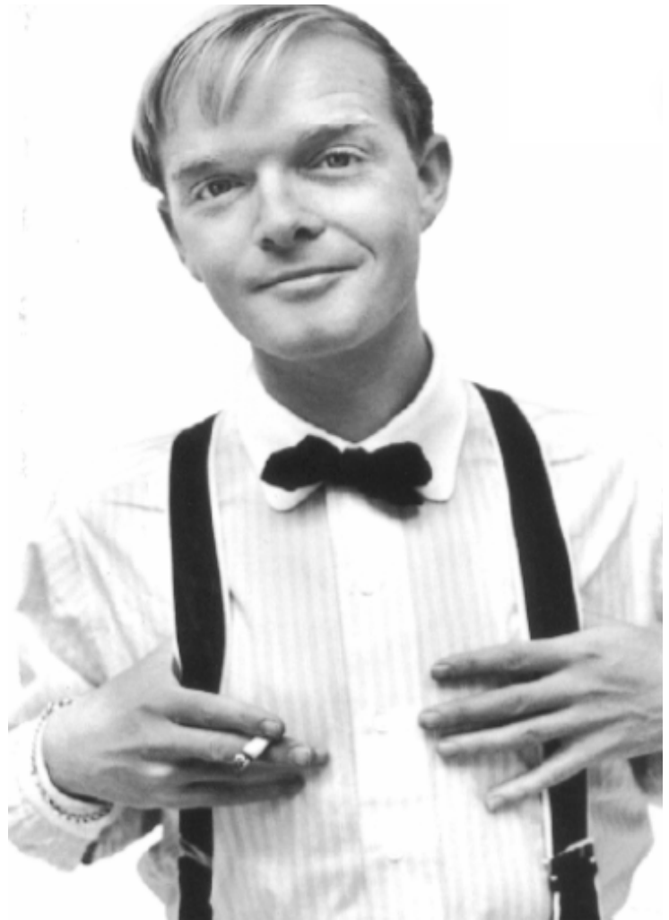
Young Truman Capote shows off his suspenders.

It can take the form of a paper, a website or a podcast.