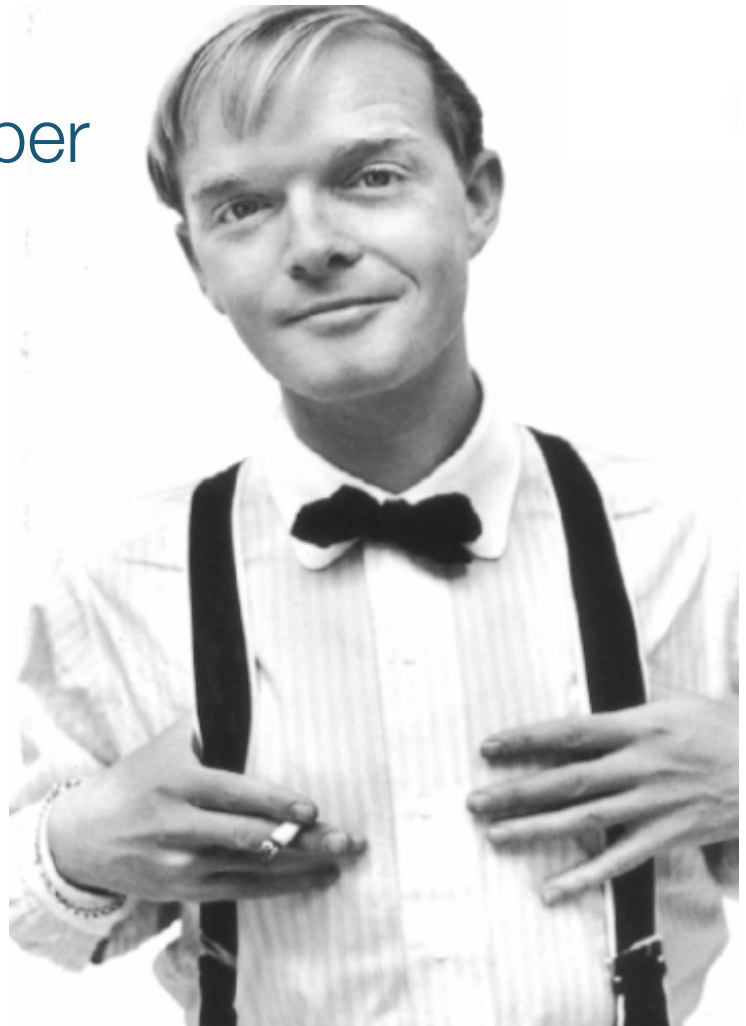
Young Truman Capote shows off his suspenders.

Citations. Follow the simple practice of indicating a citation with a superior number, then put all your notes at the end or at the bottom of the page. I prefer that book citations follow the format under the required- texts section of this syllabus. Cite interviews with a superior number and include all relevant information in the endnote. Thus: 47. Edna Buchanan, telephone interview, October 8, 2017.