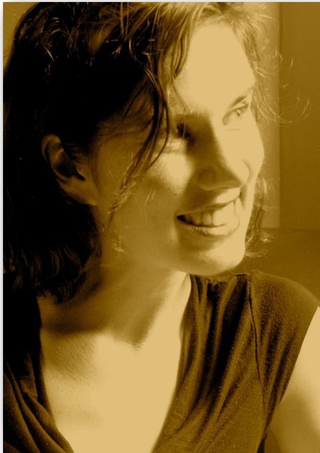
Leslie Jamison , author of the collection The Empathy Exams .