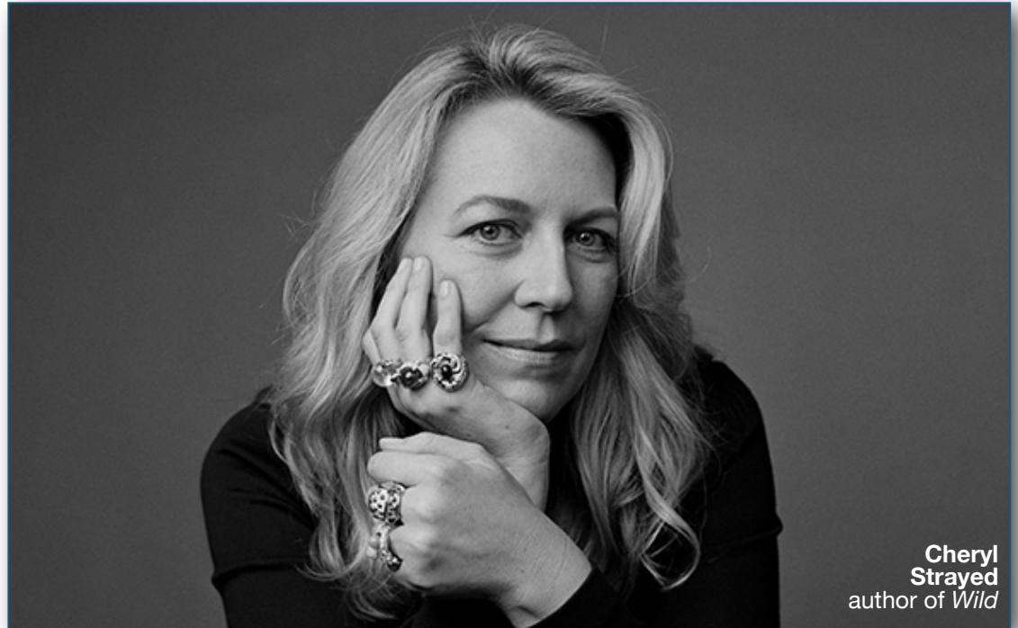
Cheryl Strayed author of Wild